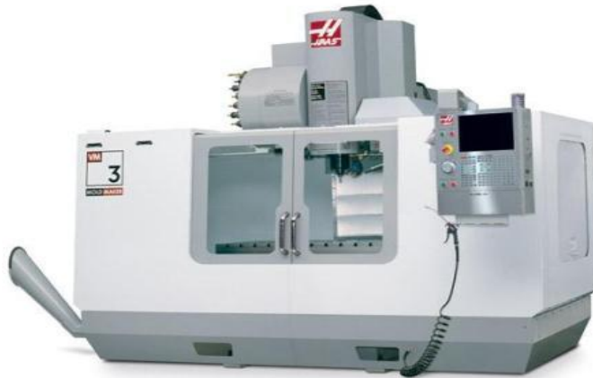
Figure 1: Main facility for FSP – HAAS VM3 mold machine.