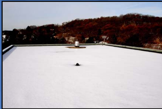
-View of available area on the roof of Morgan Hall

The objective of this study was to determine the feasibility of the installation and utilization of photovoltaic systems for on the Worcester Polytechnic Institute campus. The two most suitable buildings for a photovoltaic system are Morgan Hall and Daniels Hall. Each building has enough unused roof space to install a 3.6kW system. A cost benefit analysis was conducted to illustrate when the system would begin to save WPI money on electricity. This analysis was performed based on the cost of electricity for several different economic scenarios. This established how feasible the proposed system will be given a 10 year payback requirement by WPI facilities.