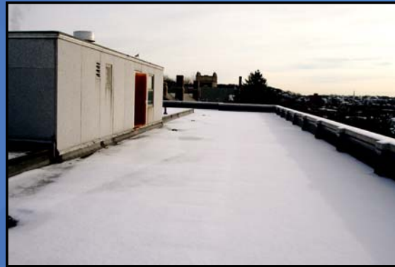
-View of available area on the roof of Daniels Hall