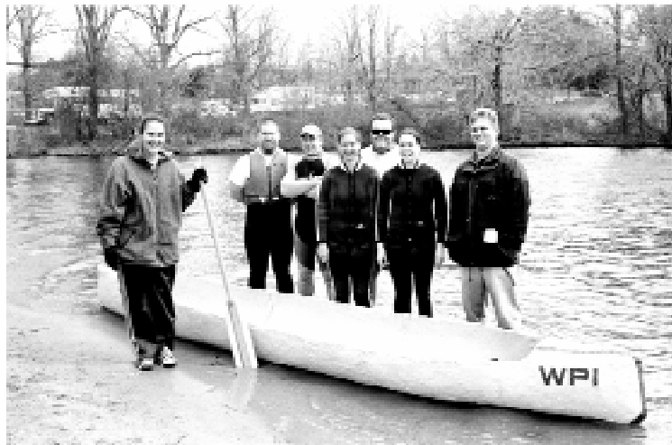
Above, the teams in front of their concrete canoe. The team finished 11th out of 14 schools.