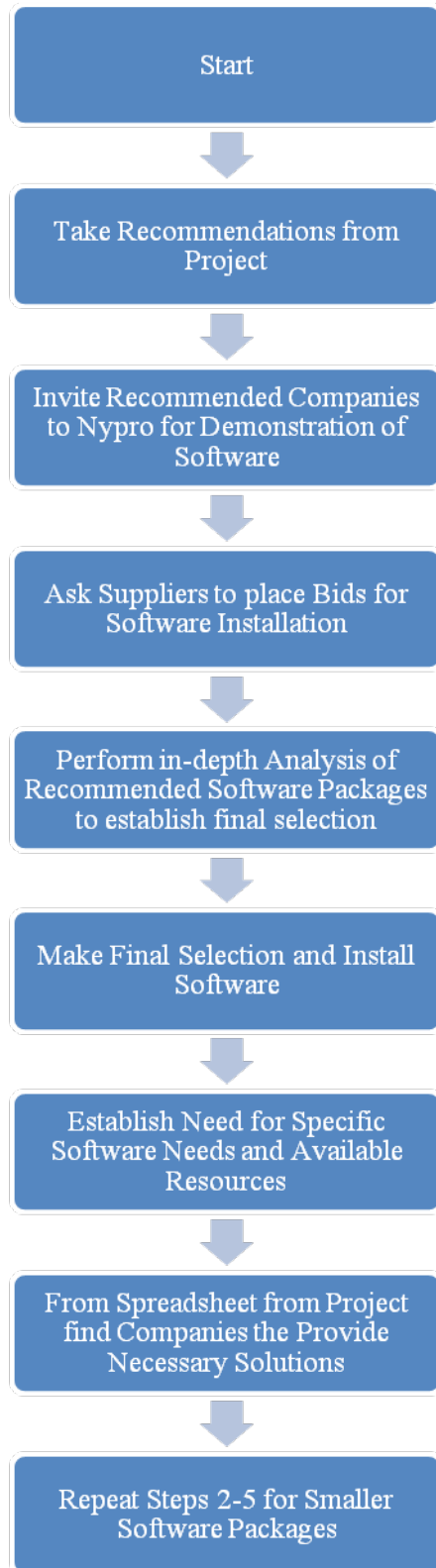
Table 10- Implementation Process