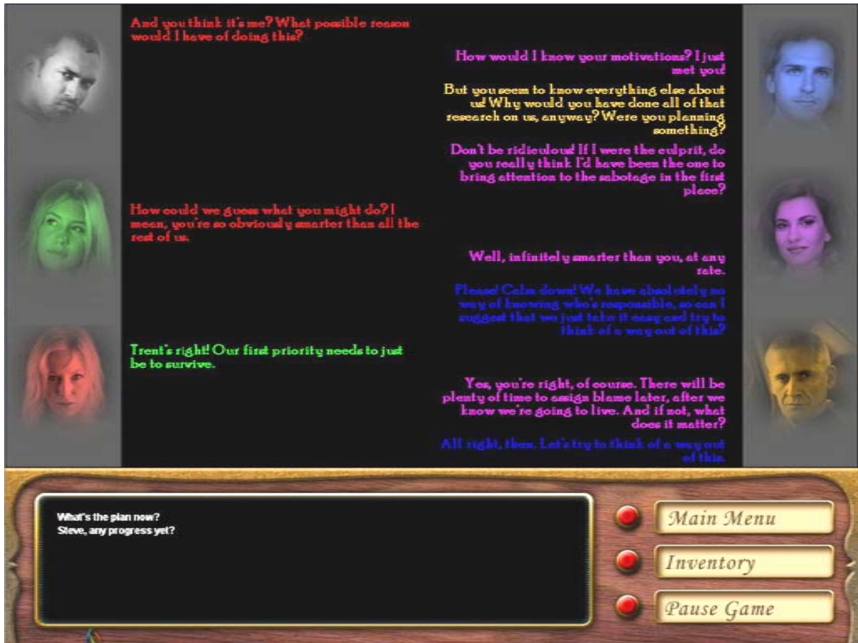
Figure 4: Color-coded dialogue in a group scene.

Forerunner solves these problems by color-coding and placing the dialogue so that lines spoken by character match the hue and alignment of the character's portrait (see Figure 4). For example, Jenny's portrait and dialogue are both in green. When her portrait is placed on the left side of the screen, lines of Jenny's dialogue will be green and aligned to the left side of the screen. Each character has its own color and character portraits are alternately placed on the left and right sides of the screen when the conversation starts. As a result, all of the lines of dialogue can easily be associated with the corresponding character at a quick glance, thereby making group scenes very easy for the player to process.