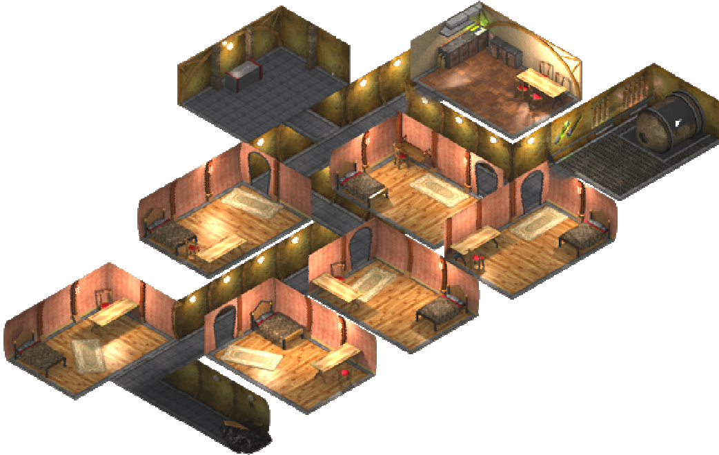
Figure 2: The entire Forerunner floor plan

In games with a first-person view, room occlusion is done automatically. Most games do not allow a player to see through walls, so the actions taking place in adjacent rooms are hidden from the player. In Forerunner , a 2D isometric view is employed. This means that the entire map is viewed from the third person, and as such adjacent rooms are not hidden from the player by default and must therefore be handled manually by the game.