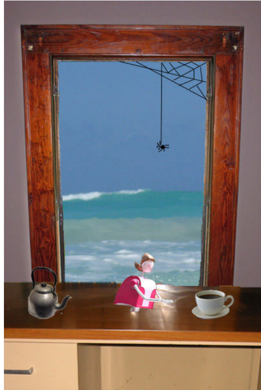
Fig. 3.2 – New desk graphic

The inspiration for the color scheme of the original site is drawn from the forest image used throughout. I have chosen to continue this color selection, focusing on greens and blues to correspond with my own “desk picture”, selected to echo the original site.