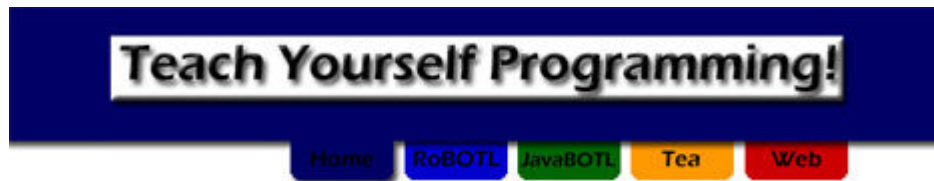
Fig. 4.1 – The Home tab of the navigation toolbar

As described in the Design phase, the user enters the site and first can observe the tabbed bar above. The bar is an imagemap, so clicking each of the tabs loads the page and sub-toolbars for each language module. The main page is loaded below the navigation bar in a separate frame. The conceptual ordering of difficulties continues in the module description on the main page.