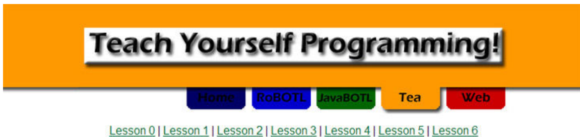
Fig. 3.3 – The navigation bar

Now that the weaknesses in the original site have been established in the area of site design, we turn our attention to the new Teach Yourself Programming site, somewhat introduced above. While the original design called for an ocean-toned site design, the final design incorporated only some of these colors. Instead, in keeping with the changes to conceptual design described below, the difficulty ranking of modules was extended into color scheme. The top nav-bar was replaced by a visual “tabbed” system, shown here.