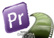
Video editing software