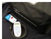
Classroom Performance System – eInstruction

Following completion of their lab students input their data into the class wide data sheet utilizing a numerical input capable Classroom Performance System (CPS) clicker. Data were displayed in real time during the lab, and made available to students for subsequent analysis and report generation.