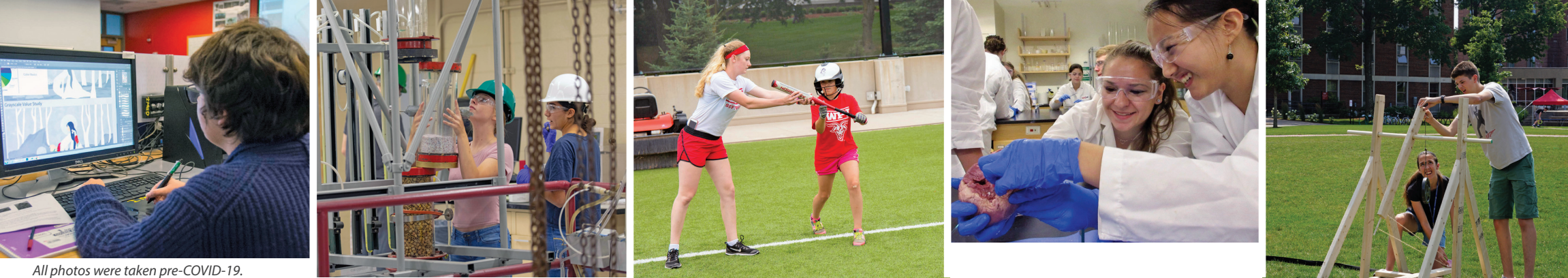
All photos were taken pre-COVID-19.