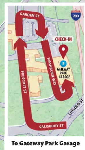
To Gateway Park Garage