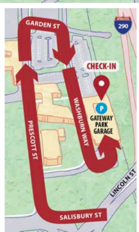
To Gateway Park Garage