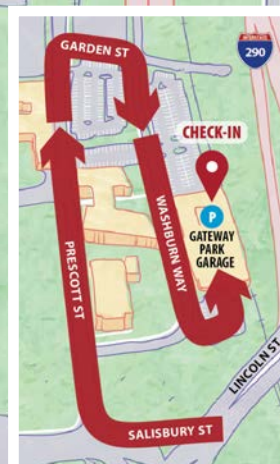
To Gateway Park Garage