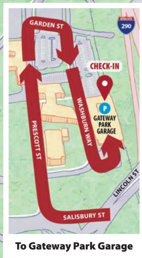
To Gateway Park Garage