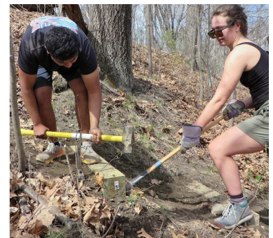
Students installed a stairway path through Salisbury Park.