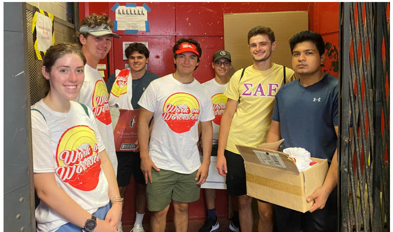
During Work on Worcester Day, sponsored by WPI's Interfraternity Council and the Panhellenic Council, students helped move the Worcester Historical Museum to another building on Elm Street.