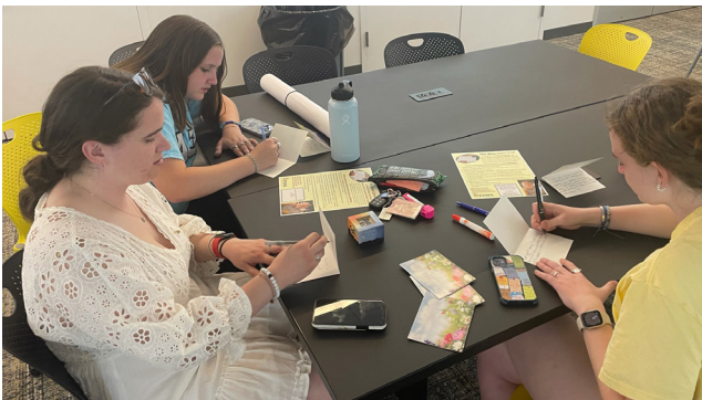
Students added a personal touch to Meals on Wheels deliveries by writing individual notes to clients.