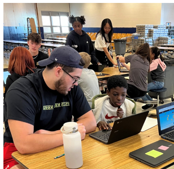
Tutoring at Elm Park Community School