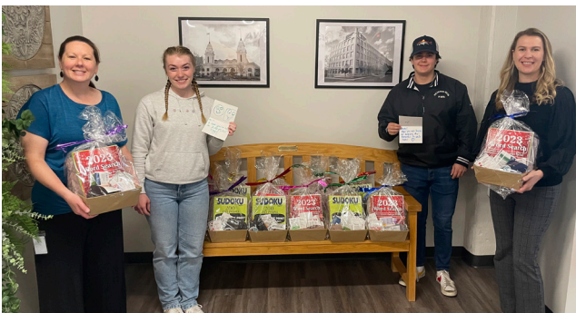
Students delivered care packages and notecards for clients of Elder Services of Worcester Area.