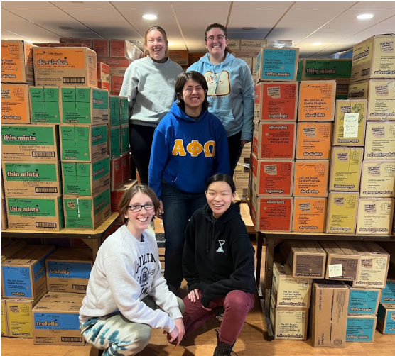
Members of the Alpha Phi Omega national service fraternity at WPI helped deliver Girl Scout cookies.

You never know where you'll see WPI students participating in Worcester community life throughout the year. Here are just a few of the places we caught them in action during the 2022-2023 academic year.