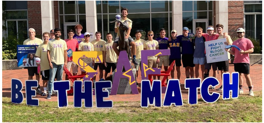
Sigma Alpha Epsilon at WPI once again held its Be the Match bone marrow drive.