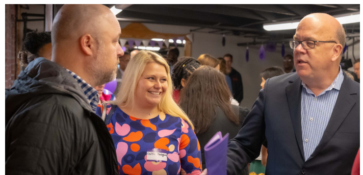
Congressman Jim McGovern D-MA joined the festivities at the opening of the Flourish at Thrive Food Pantry, created with the help of a WPI student project team.

To develop effective, sustainable plans for the Thrive Food Pantry, Tonani and team focused on four primary objectives: utilizing demographical data on the population that the project is assisting to assess their nutritional and accessibility needs; connecting with nearby food pantries to better understand effective operating procedures; developing precise space and inventory plans, staffing schedules, blueprints, and other deliverables for the food pantry while considering the sponsor's available space and budget; creating partnerships with campuses, markets, and other organizations for the food pantry to continue functioning after the project's completion.