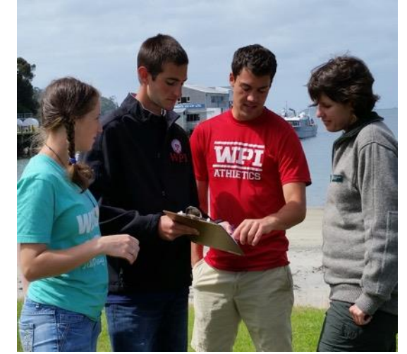
THE GLOBAL SCHOOL