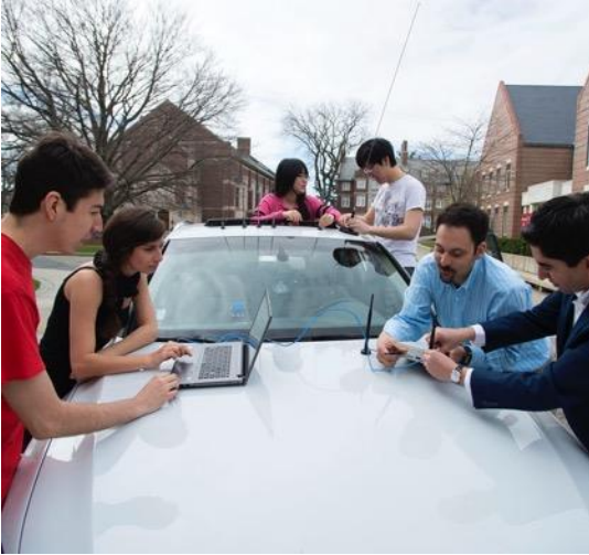
SCHOOL of ENGINEERING