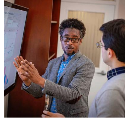
THE BUSINESS SCHOOL