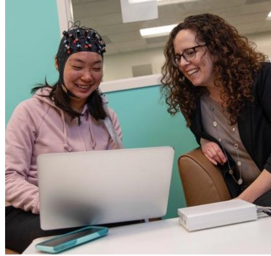
SCHOOL of ARTS & SCIENCES