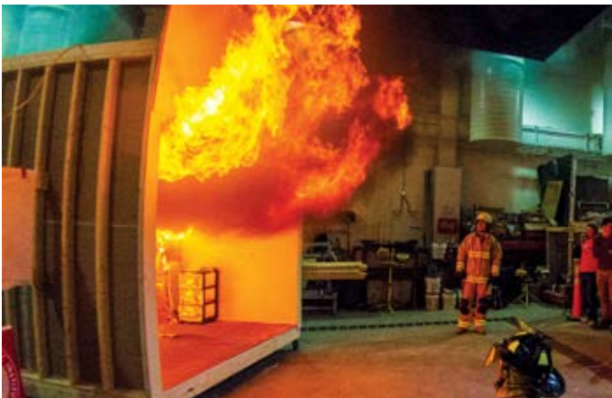
WPI's UL Fire Protection Engineering Performance Lab allows for large-scale tests and project-based research.

Partnerships with universities around the world give students the opportunity to study with affiliated institutions and participate in student exchange programs. Our programs are expanding to include partners in the Middle East and beyond.