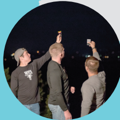
Bar Harbor, Maine preserving the night sky in Acadia National Park

100% of undergraduates receive a Global Scholarship