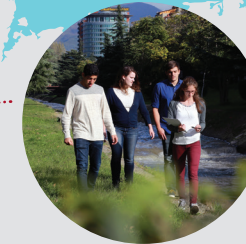
Tirana, Albania shedding light on pharmaceutical waste management