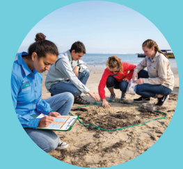
Melbourne, Australia implementing a methodology to monitor microplastics on beach environments