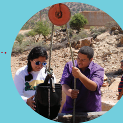
Rabat, Morocco developing a Greywater Recycling System to support a fog harvesting initiative