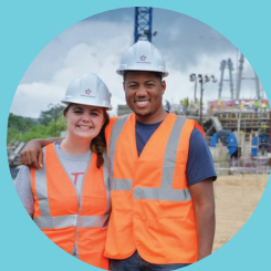
Panama City, Panama responding to challenges following the Panama Canal expansion project