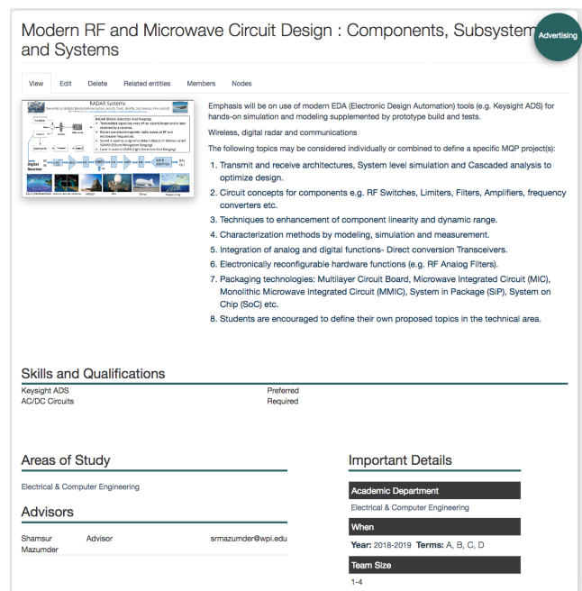
Fig. 2: Viewing an MQP Opportunity

The MQP detailed view displays the project's title, image, description, abstract, required and preferred student qualifications, areas of study, advisor contact information, academic department, sponsors, team size, academic term, CRN, sponsor information, U.S. citizen requirement, continuing project indicator, status, and the external URL.