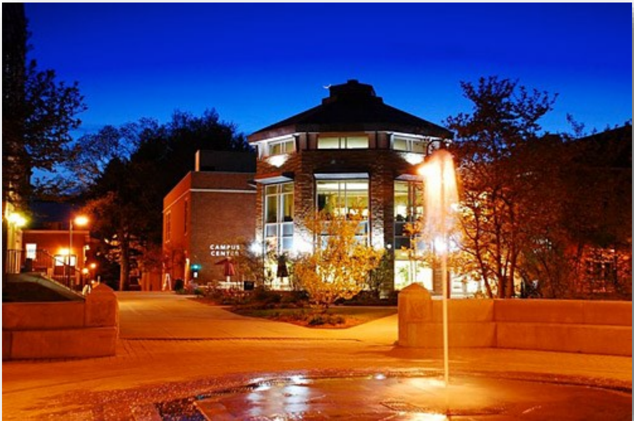
WPI CAMPUS CENTER AT NIGHT

wpi.edu/offices/policies/honesty/policy.html